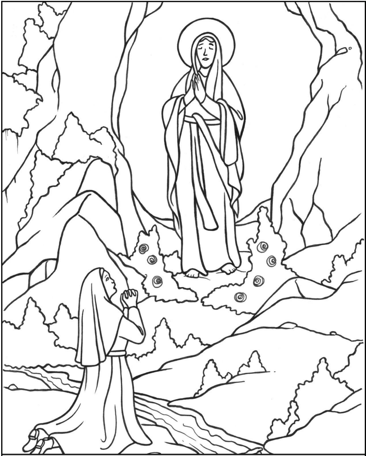
Our Lady of Lourdes