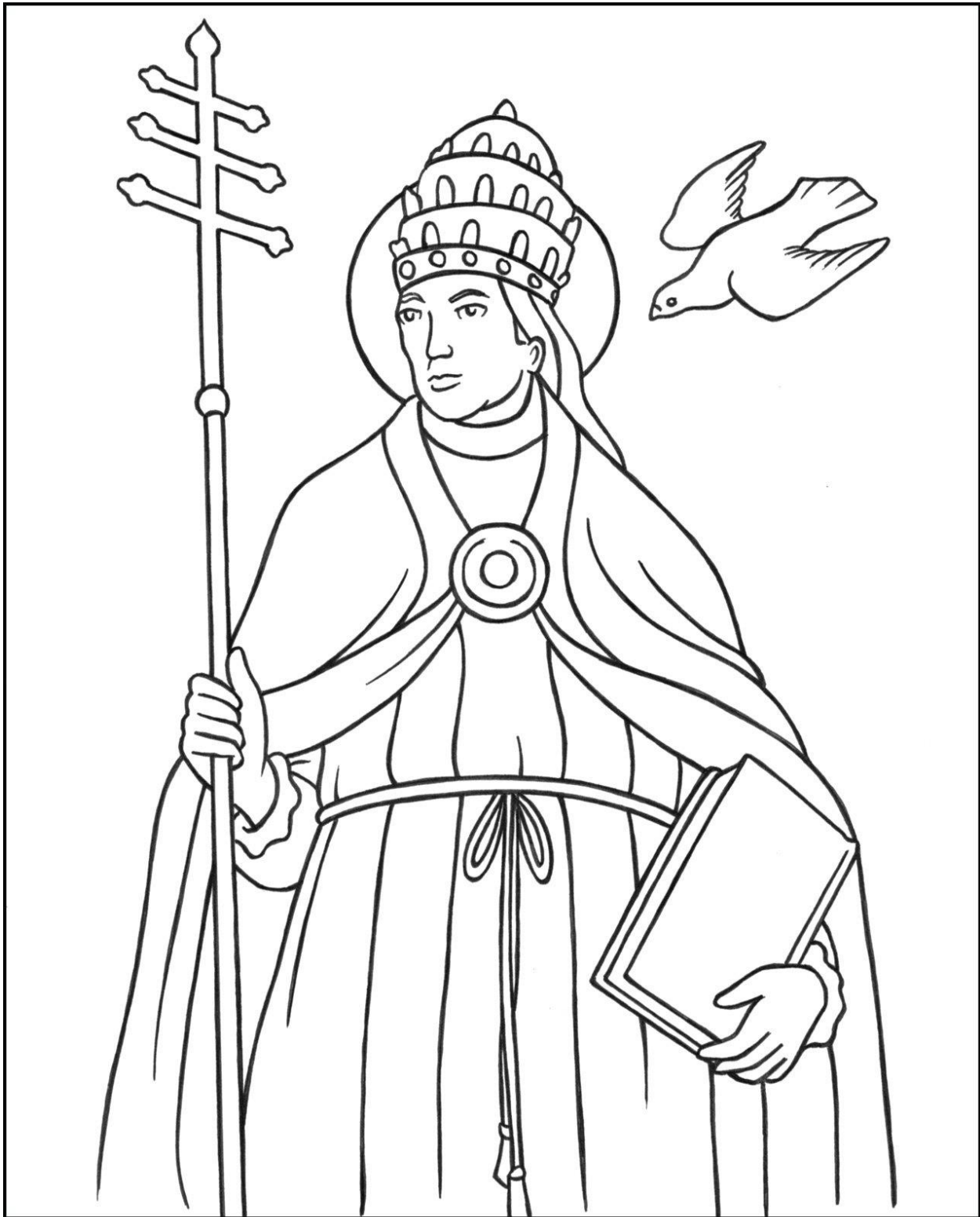
Pope Saint Gregory the Great