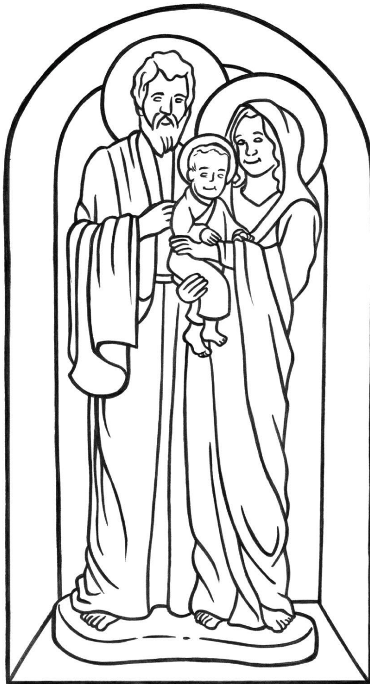
Statue of The Holy Family