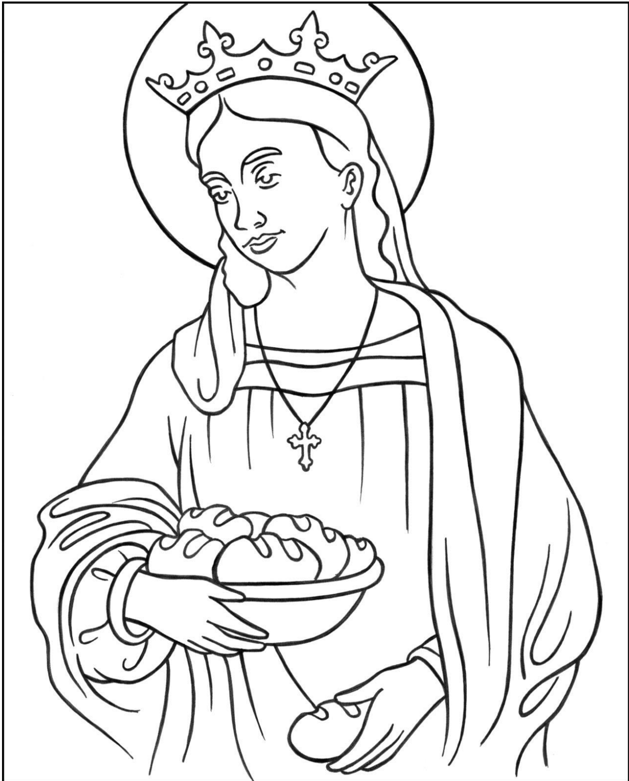
Saint Elizabeth of Hungary - TheCatholicKid.com