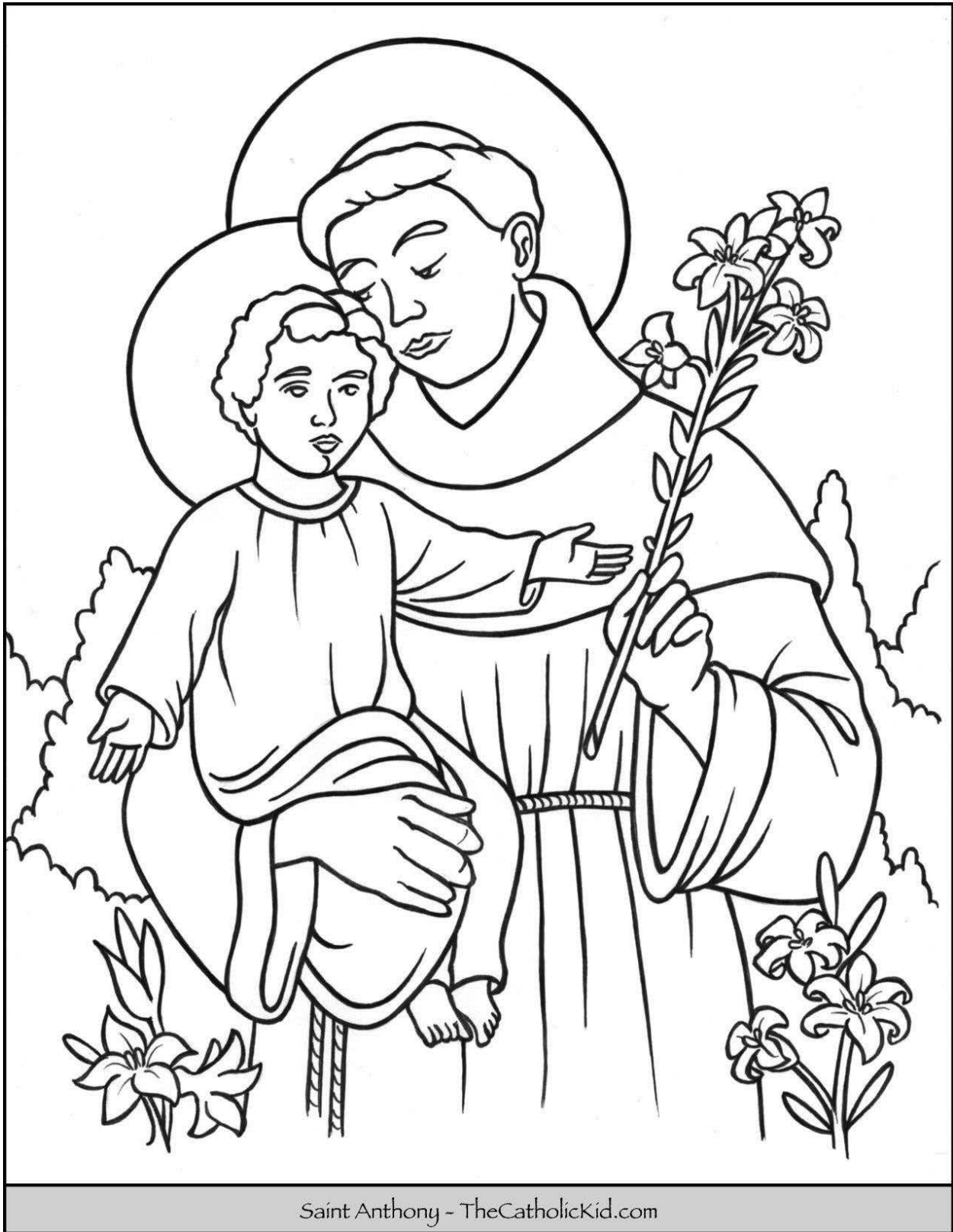
Saint Anthony - TheCatholicKid.com