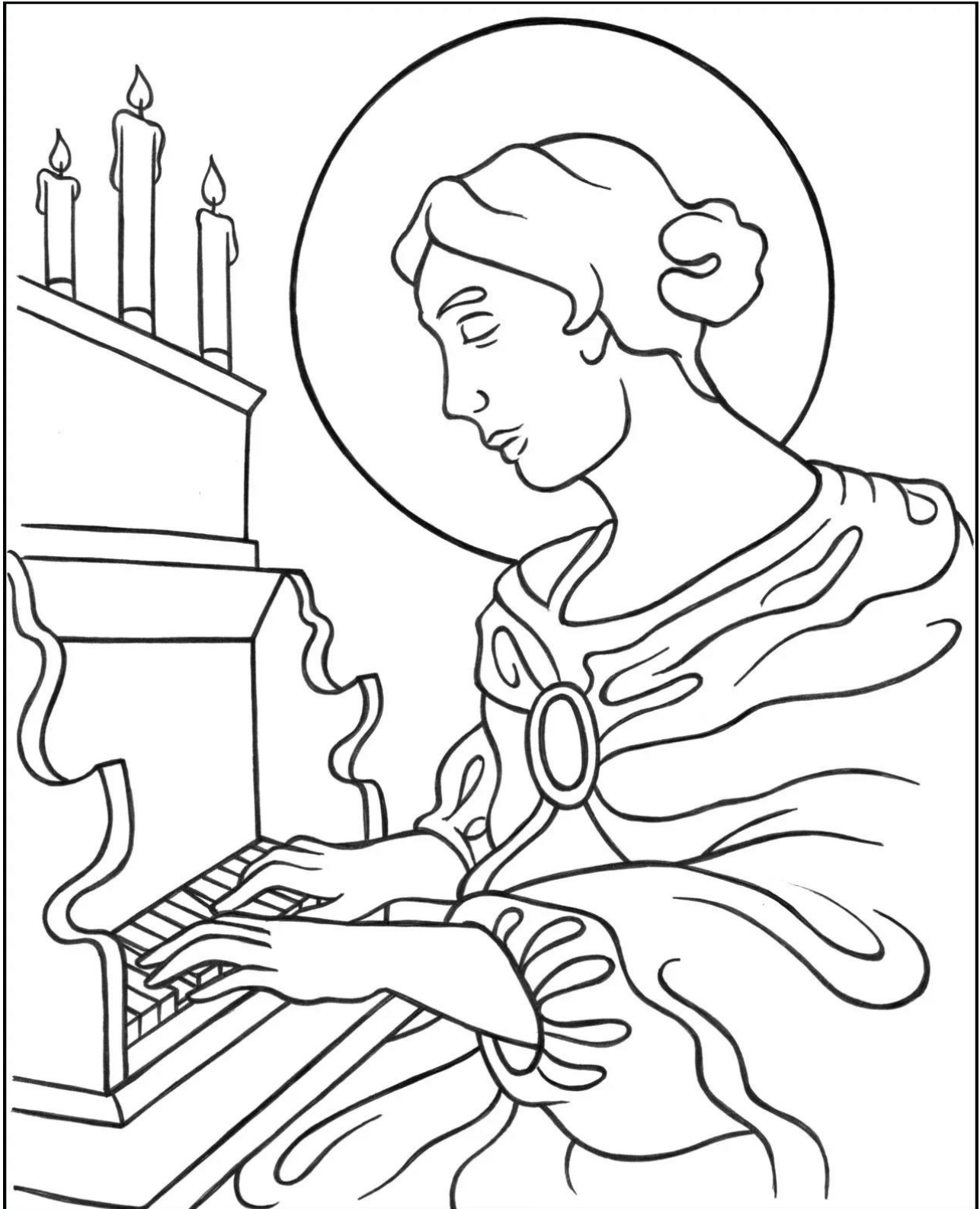
Saint Cecilia - TheCatholicKid.com