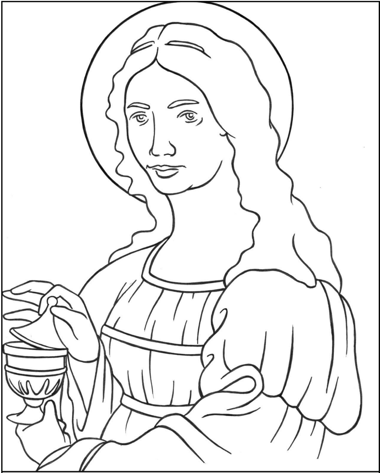
Saint Mary Magdalene - TheCatholicKid.com