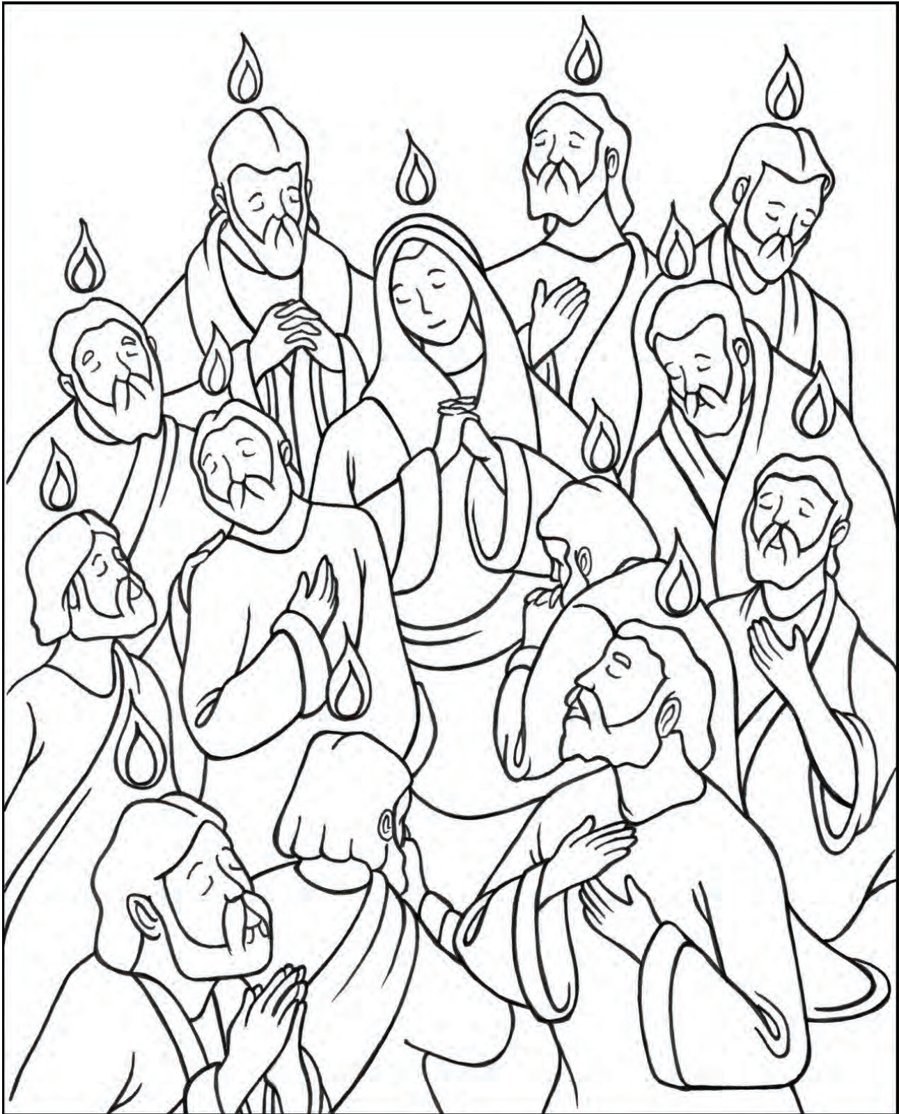
3rd Glorious Mystery: Descent of The Holy Spirit