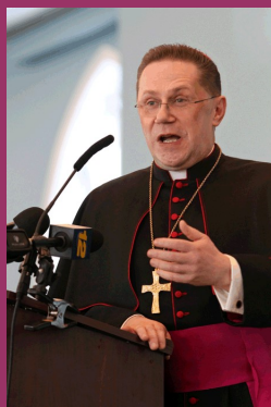
BISHOP ANDRZEJ ZGLEJSZEWSKI THE ALTAR: THE SOURCE & SUMMIT OF OUR FAITH MARCH 31ST